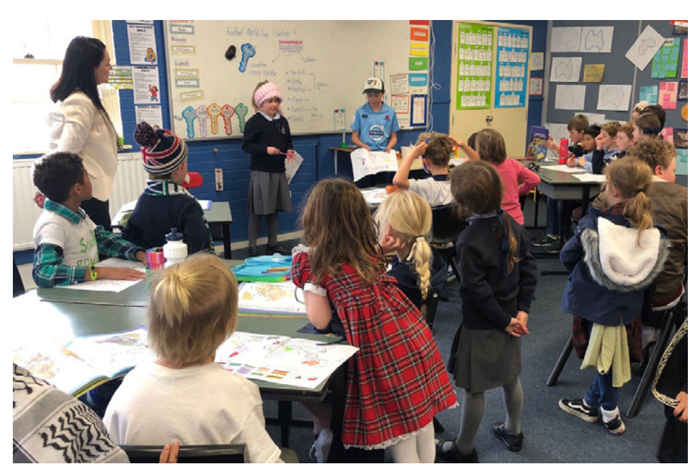
Sharing our learning across the grades at the end of a great Activities Day