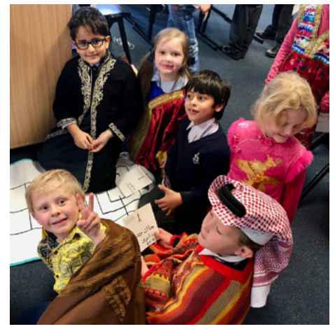
Learning about Saudi Arabian culture