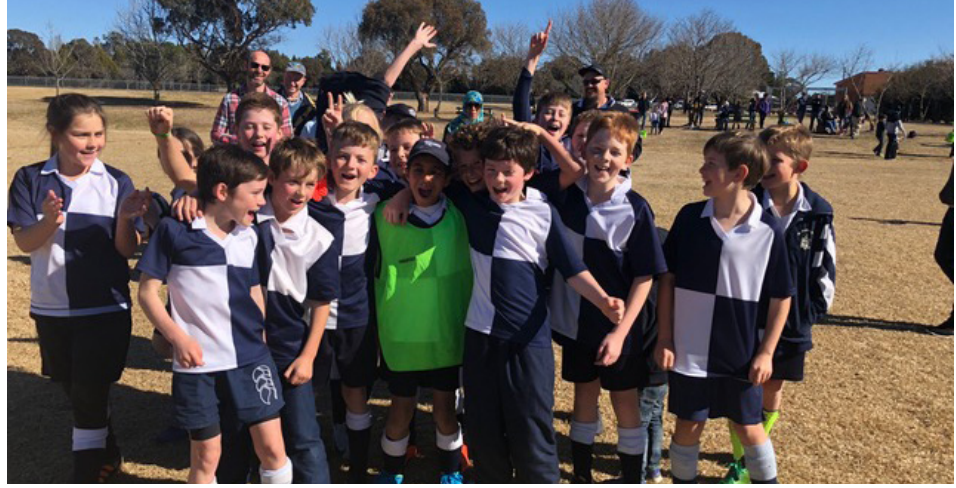
TAS Blues U10s