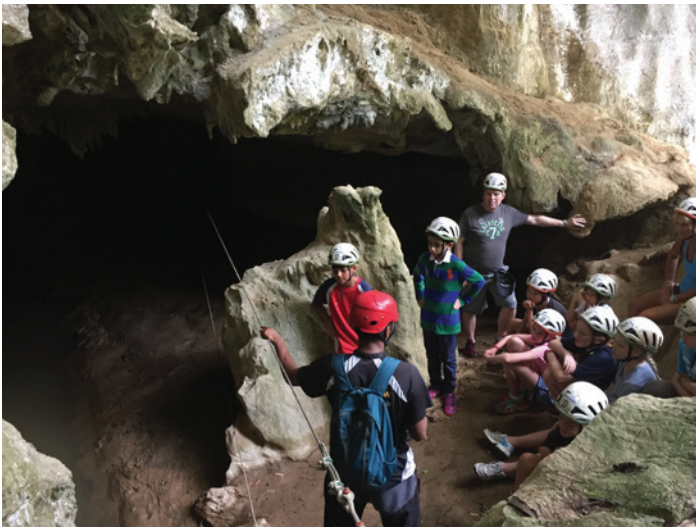
Challenge by Choice - overcoming your fears...