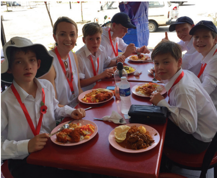
Enjoying the local cuisine