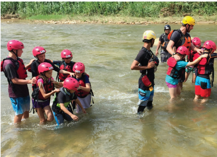
Working together to overcome problems...learning about responsibility.