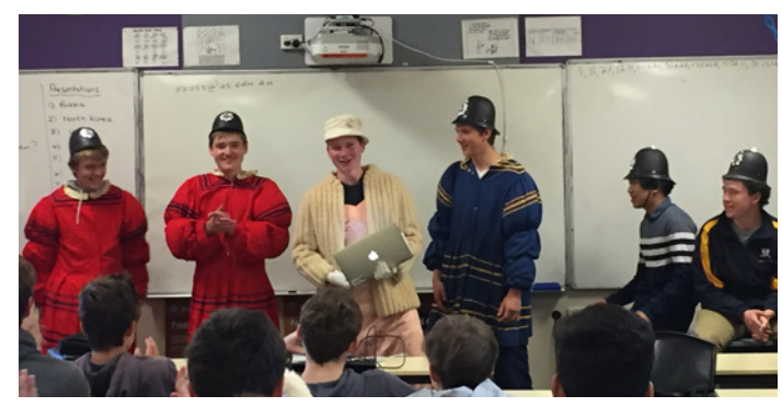
Year 10 'England' got into the spirit of things when they presented an overview of their political system of government in their study of Democracy

While the week's highlights included UN Youth's Model UN and workshops on alternative forms of voice, the popular multisport World Cup, the team trivia contest and the final creative presentations in Hoskins on the issue of '16 year old's being conscripted to a UN Peacekeeping Force', (to see the winning presentation click <a href="https://youtu.be/GcTpA7gcV5o">https://youtu.be/GcTpA7gcV5o</a>) the real pleasure was seeing the level of engagement and interest of Year 10 students. We hope that for a week out of usual classes, they can reflect on the principles of Democracy as one of the foundation tenets of Round Square.