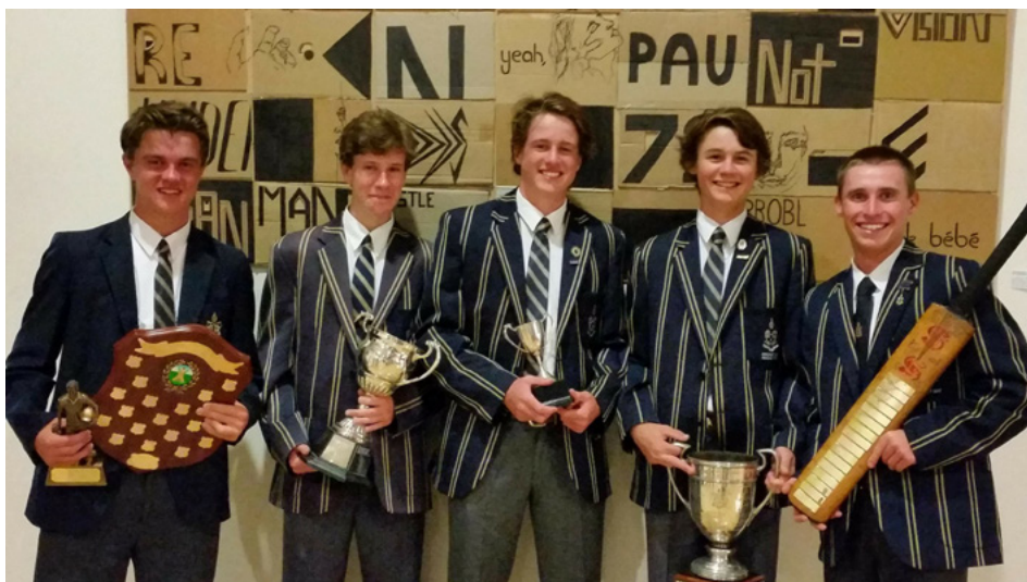
Opens Cricket Dinner Awards (trophies above)