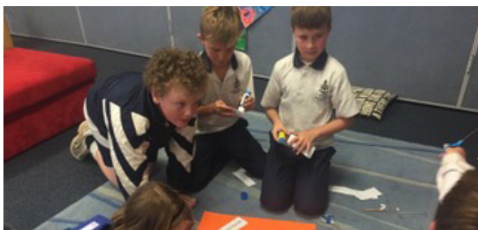
Year 4 discussed the concept 'Change' when categorising materials. Some great discussions were had about whether the changes were 'physical' or 'chemical'

If you have any expertise in any of the units mentioned above please do not hesitate to let your class teachers or myself know. Parent involvement can be a way to enhance learning.