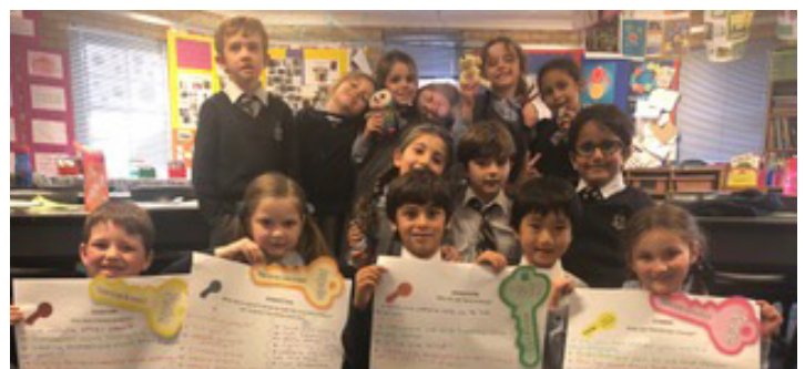
Year 1 explored friendship through conceptual lenses