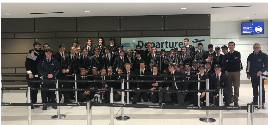
TAS squad on their departure