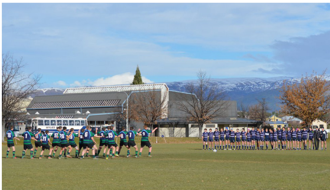
NZ Opens v Otago Haka