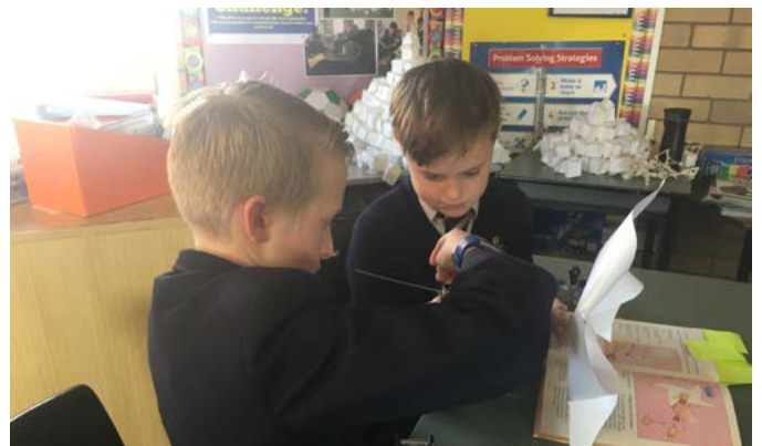
Team "Sky" creating models to support research findings.