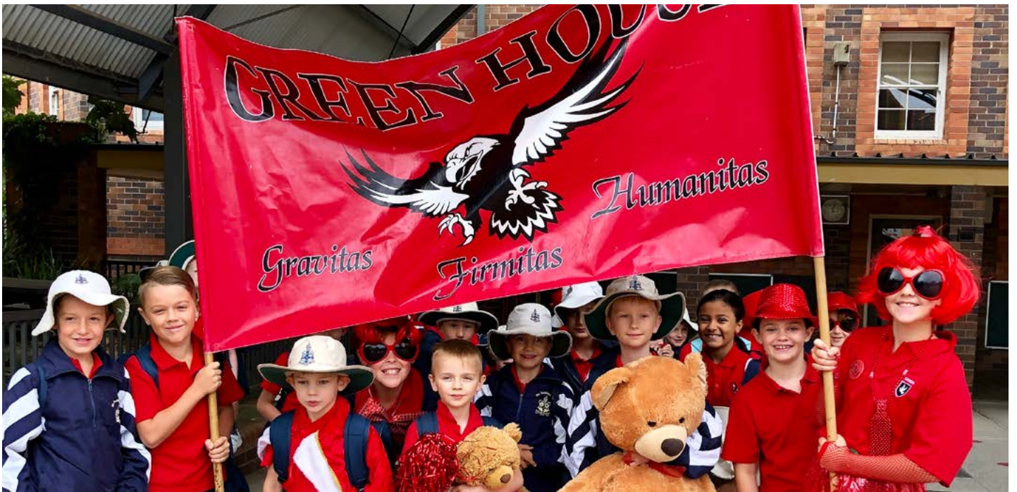
Green House were very competitive on the day coming second in the House Championship