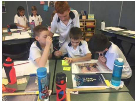
Year 4 collaborate to complete a 'See, Think, Wonder' based on a stimulus picture as they explore what different cultures value.