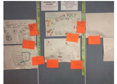
Year 5 unpack their central idea and mind map focus areas they could inquire into to develop a greater understanding.