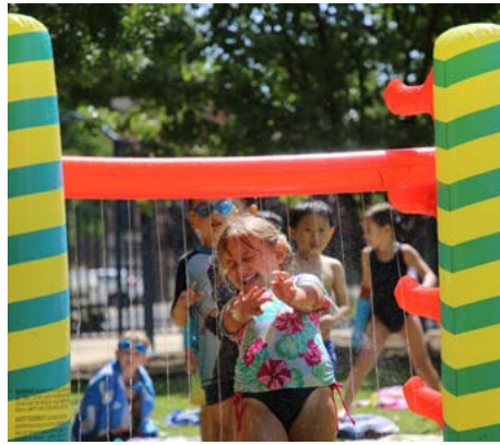
Kindergarten- learning about all the things they can do whilst enjoying water play.