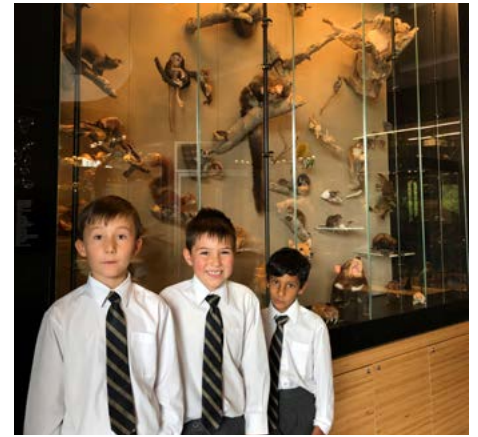
Year 3 went on an excursion to The Natural History Museum, UNE to explore the question: What is adaption?